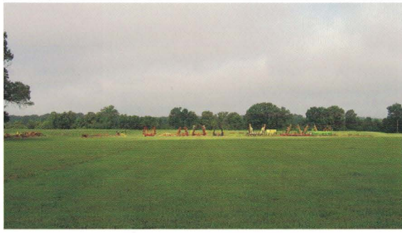
Curtis Steele, implements, v.1, 7.18.07 , digital photograph/digital video projection, copyright 2007